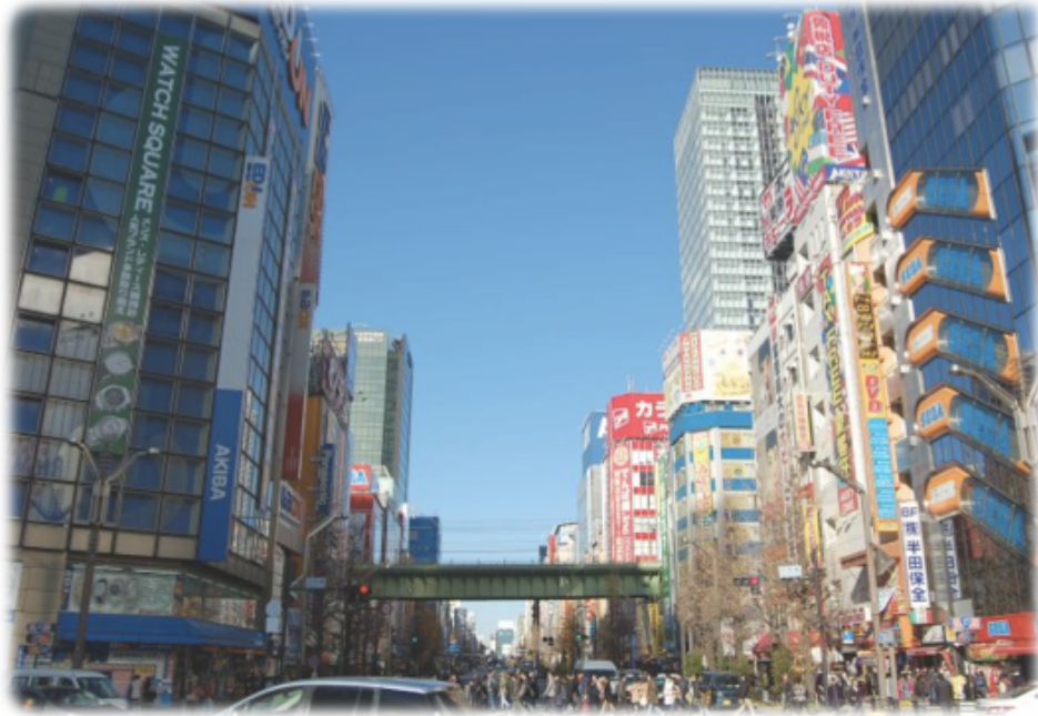
Akihabara electric town