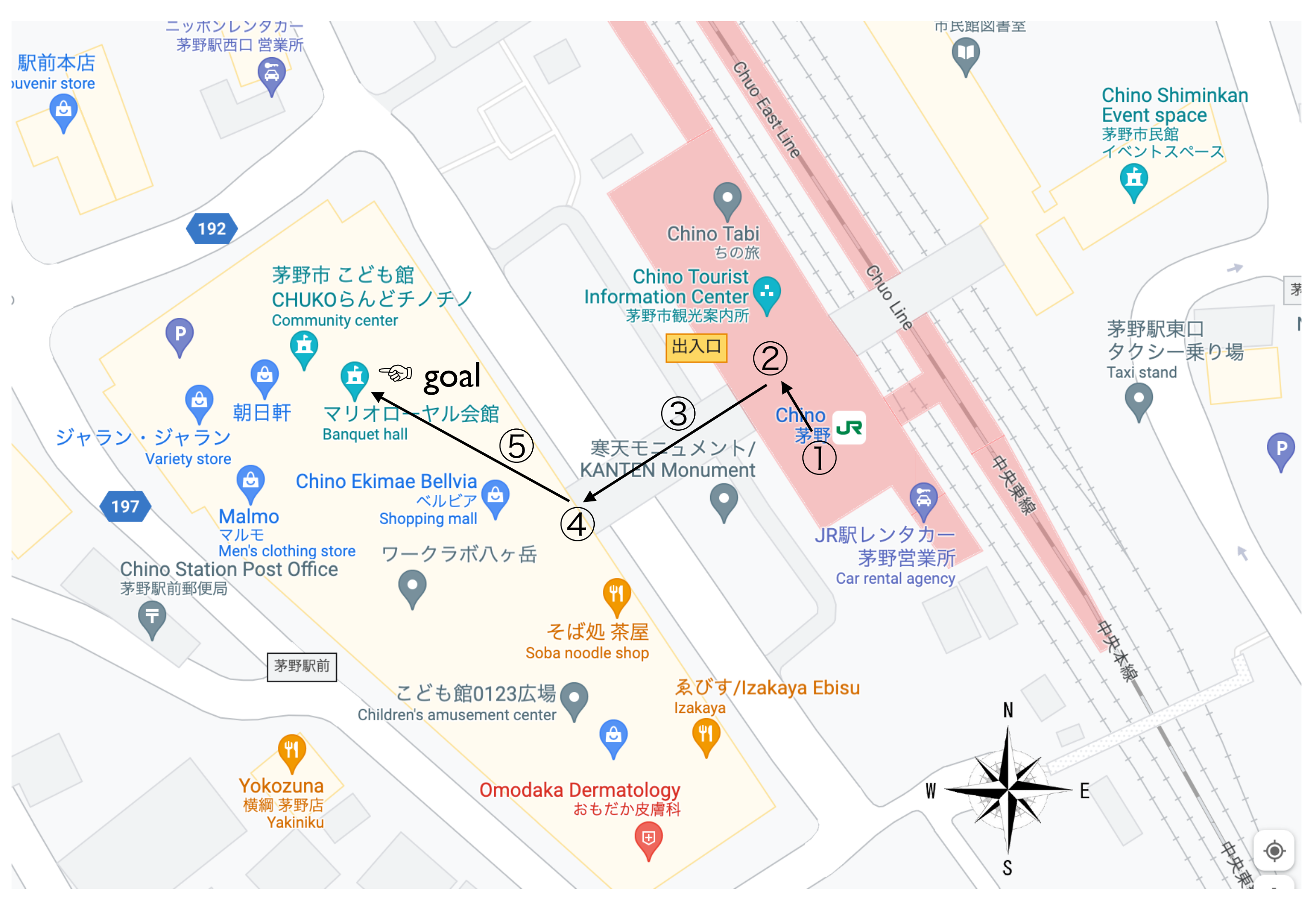
If you get lost, please ask people "where is Mario Royal Kaikan?"